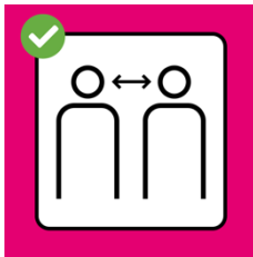
Keep your distance.

Continue to follow the hygiene and social distancing rules. We don't want the spread of the new coronavirus to increase again.