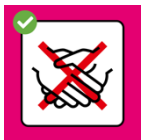
Avoid shaking hands.