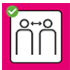
Keep your distance.